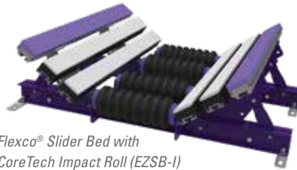
Flexco® Slider Bed with CoreTech Impact Roll (EZSB-I)